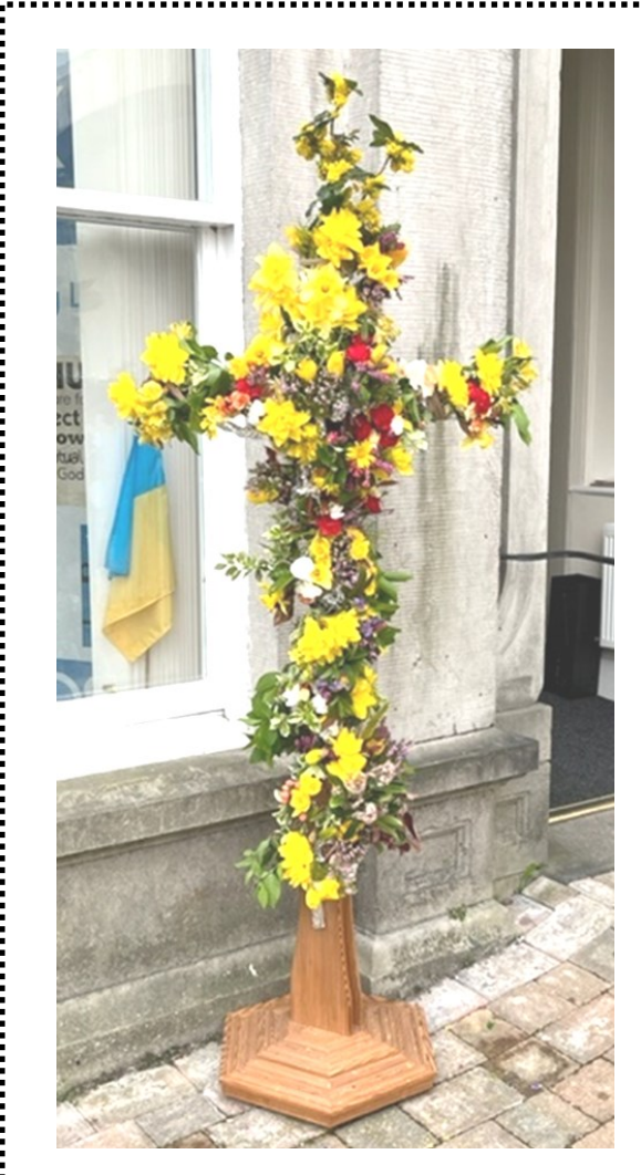
The decorated Easter cross outside 106